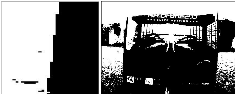
Figure 3 Corner step edge [22] [24]

The image frame in TIF is converted to binary from greyscale image. Binary image contains only 2 pixels' value which are 0=white and 1=black, while greyscale pixels' value is from 0 to 255. To performed this conversion, we use luminance level of 0.5, which means any greyscale image pixels higher than 127.5 will replace into white otherwise black. Having performed this conversion, edge of the obstacle can be localized or transformed into many steps corner (see figure 3). We take this advantage to know the edge coordinate in the image by applying Harris corner detector.