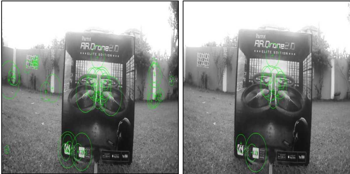
Figure 2 SURF keypoints features [20] [22]

Several experiments were performed to determine the appropriate scale changes by varying the distance between RIF and TIF. For this experiment, TIF distance has been fixed to 4ft. This is due to the fact that, if the TIF distance keep increasing, then obstacle size or blob will be small in the image as compared to the surrounding. As a result, the SURF algorithm will produce a lot of keypoints to the background rather than to the obstacles itself. On the other hand, if the TIF distance is small enough, the avoidance planning by the UAV towards the obstacles will be a problem. These scale changes are the scales that are able to separate or distinguish the obstacles from background of an image