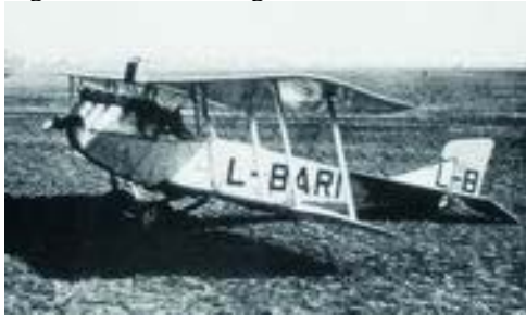
Pic. 2 Aero A-14 Brandenburg

international flight was in 1930 from Prague, through Bratislava to Zagreb.